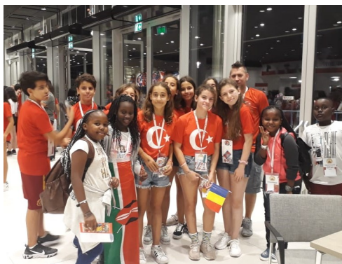
Champions at World scholars Cup Global round

The World Scholar's Cup regional round that included schools from East African countries was held in Nairobi on 12th and 13th February. Our school was represented by a team that earned a total of 60 medals. Round 2 of the World Scholars Cup was hosted by the Light International School Mombasa on the 2nd and 3rd April, the team managed to scoop 121 medals. Both teams qualified for the 2019 Global round. We managed to send a team of four pupils to the global round in Amsterdam (Netherlands) on 21st– 26th July for the global challenge. They represented us well by earning a total of 12 medals, 3 gold and 9 silver medals.