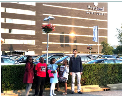
Our students at the World Scholars cup in Amsterdam, Netherlands