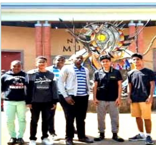
Our Students visit to Nairobi Museum.