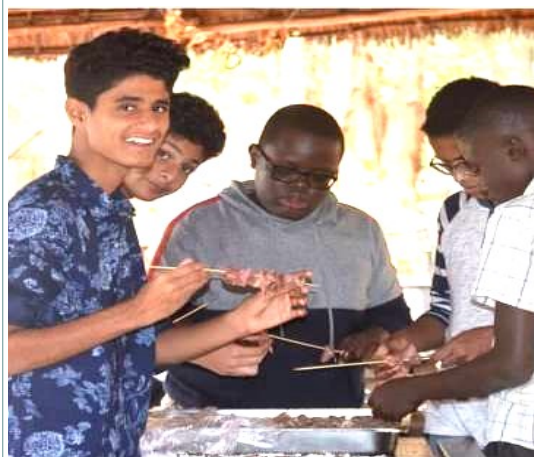
Students enjoy BBQ picnic