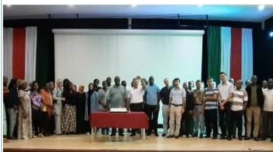
Light Academy Appreciates our Teachers on Teachers day 2019